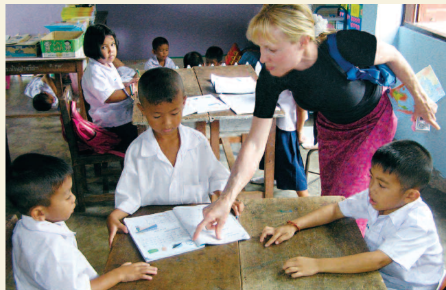
An American teacher participating in AsiaPacificEd Program's Schools-Helping-Schools initiative connects with students in tsunami-affected areas of Thailand.

Another initiative included the Schools-Helping-Schools (SHS) project, established by the Center's AsiaPacificEd Program in collaboration with an EWC alumni network of teachers. The SHS initiative connected American students with those in tsunami-stricken schools in Thailand and Sri Lanka. AsiaPacificEd teachers across the U.S. raised funds with their students to provide needed supplies for their partner schools. Later in the year, the program brought 20 American teachers to Thailand to witness recovery efforts. In 2006, 25 American students will visit Thai schools in the affected areas and Thai students will travel to Honolulu, as part of a new program focused on youth building disaster-resilient communities.